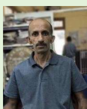
Sh. Gulshan Kumar